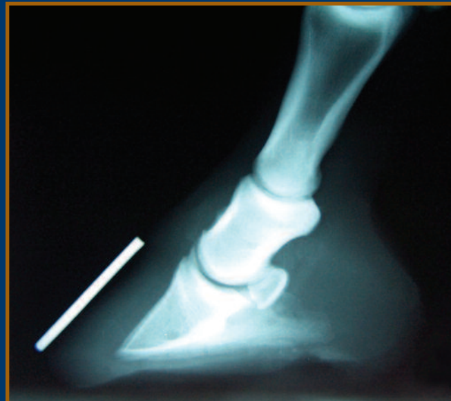
This X-ray shows a 15-year-old Quarter Horse with the coffin bone penetrating the bottom of the foot. “The horse was covered with ‘bed sores,’ and unable to walk forward,” Pete recalls. “He actually shuffled around in reverse trying to graze.”